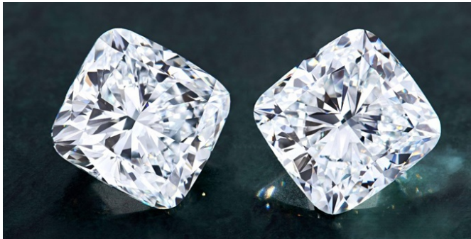
Pair of matching diamonds from Venus Jewel

Show Daily by JNA > HKTDC March Hong Kong Fairs | March 1, 2025