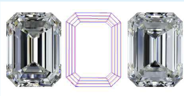
The above image is the Venus Perfect Match Pair.

Although the basic details may identify it as a perfect match pair, they do not physically resemble a match pair. This is where the additional parameters of the Matching Pair criteria from Venus become crucial.